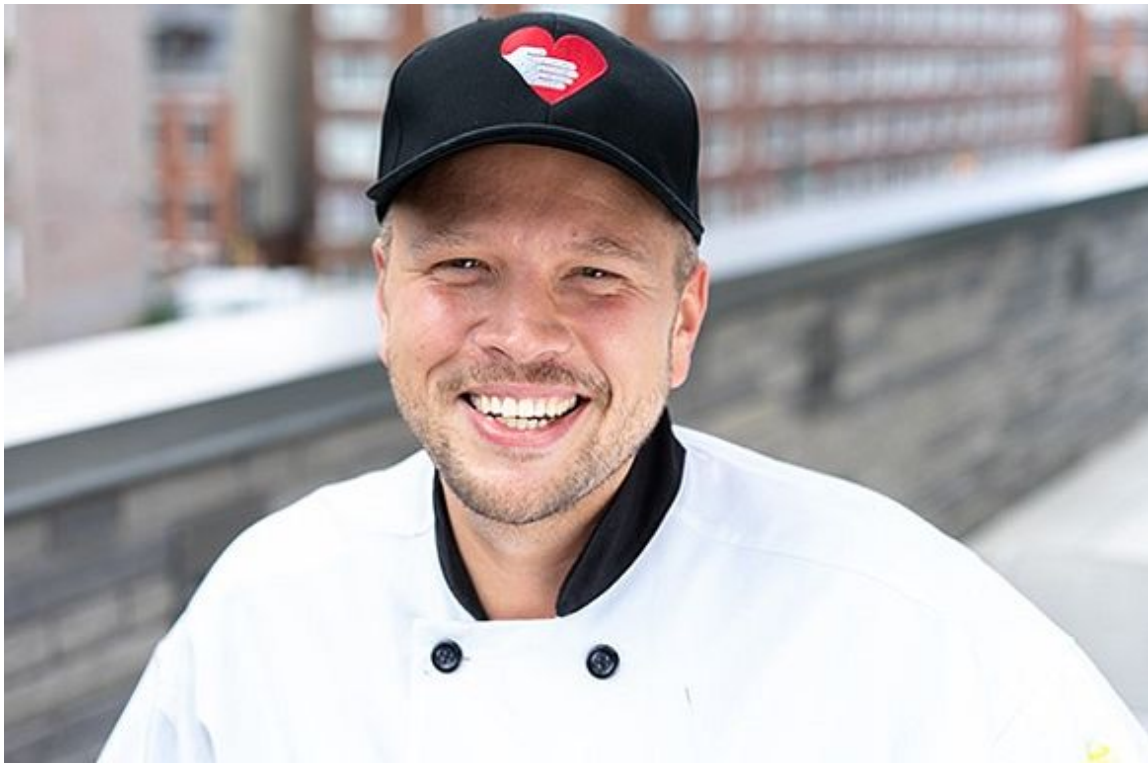
Executive Chef, God's Love We Deliver