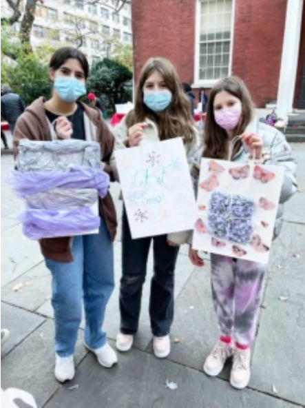
Students with their decorated bags