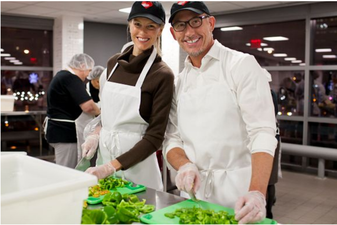
Table for Love