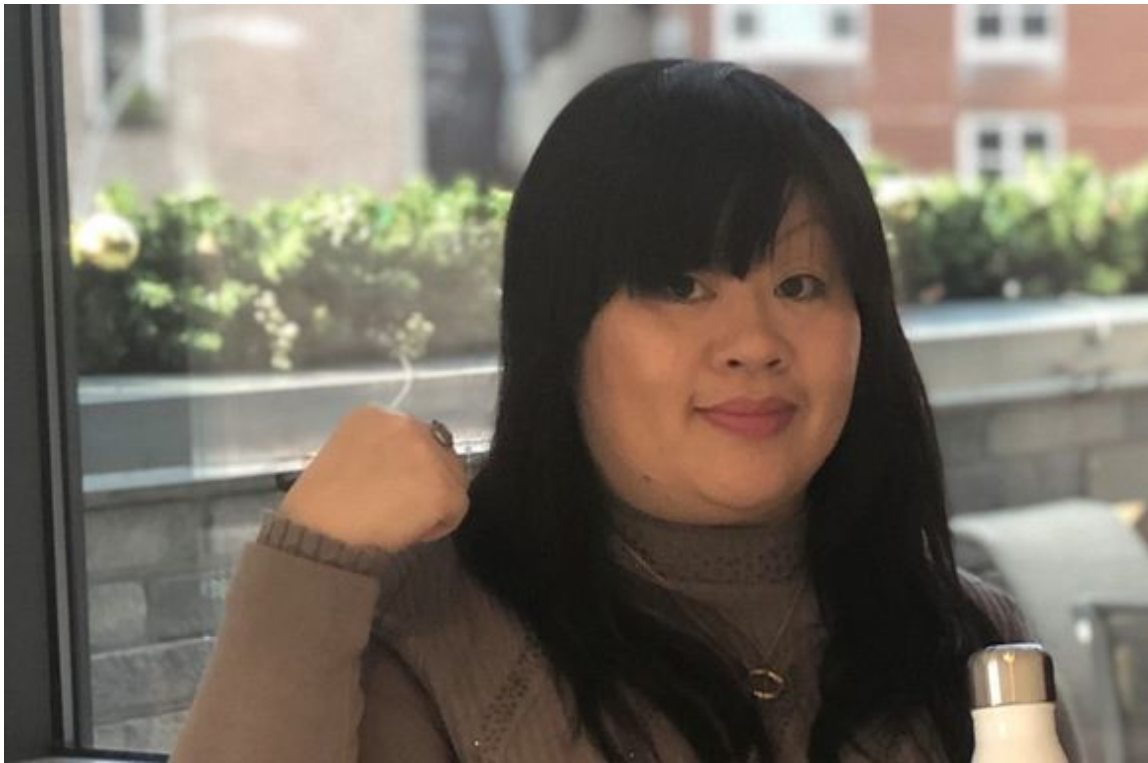
Client Services Specialist