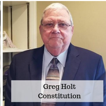
Greg Holt Constitution