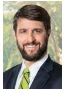
Lynwood Evans Personal Injury -