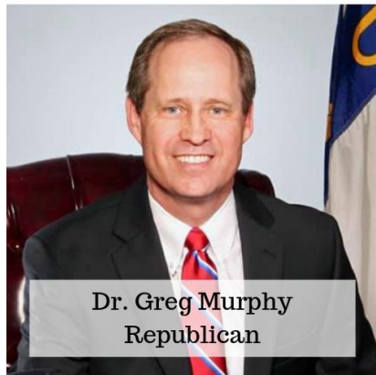
Dr. Greg Murphy Republican